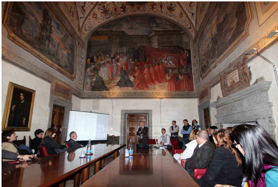
Meeting at the city hall with Mayor & local authorities

Italy. Along with its free system of elevators and escalators, Perugia becomes a vertical city allowing for its users an easy sense of mobility.