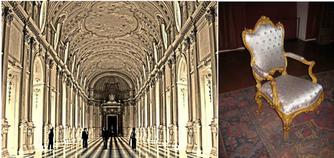
La Venaria Reale Palace's Interiors

We had the chance to visit La Venaria Reale, the Museum of Cinema and the DNA Italia fair. The sumptuous palace of la Venaria Reale serves today as a museum and the foundation for conservation and restoration, a learning center where works of art can meticulously be restored.