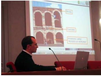
Presentations of two projects